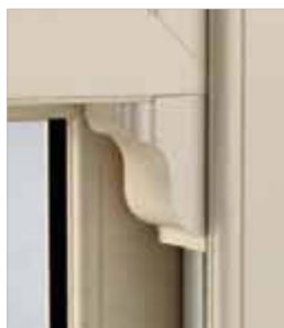
Clip On Sash Horn

Vertical sliders can be further personalised with the addition a Georgian or Astrical bar. Georgian bar is fitted within the glazing unit itself, and Astrical bar is affixed to the outer pane; both bars are available as a single or grid option.