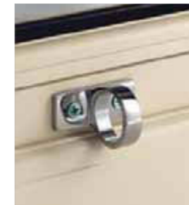
Sash lift ring-pull