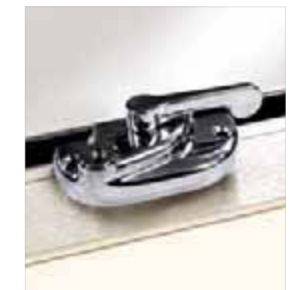
Sash lock & keep