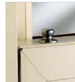
Tilt latch button