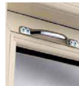
Sash lift handle

A range of traditional sash furniture options are available including: ring pulls and handles, decorative tilt latches and 'catch & keeper' style locks. Sash furniture is available in silver, gold and white.