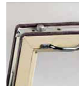
Top sash release button