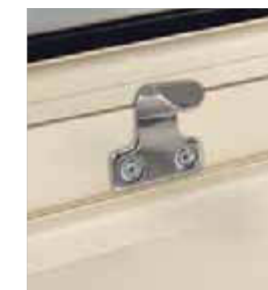
Sash lift hook