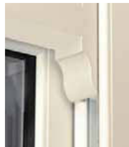
Run-through Sash Horn